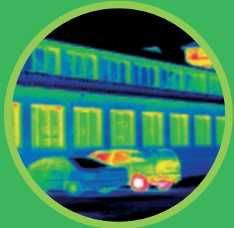
Warm Edge Windows showing virtually no heat loss.