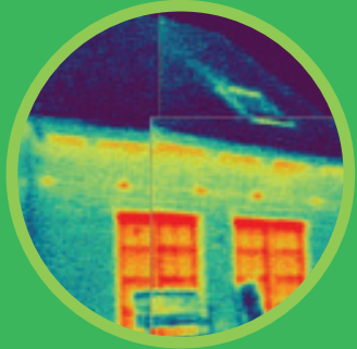
Thermal photograph showing standard cold edge windows - red signifies area of heat loss.

The term 'Warm Edge' within double or triple glazing refers to the spacer used to separate the panes of glass. If the spacer material is less conductive than traditional aluminium spacer ( \leq 0.007\text{W/K} ), it is termed warm edge. Non-metal spacers generally have a lower thermal conductivity value.